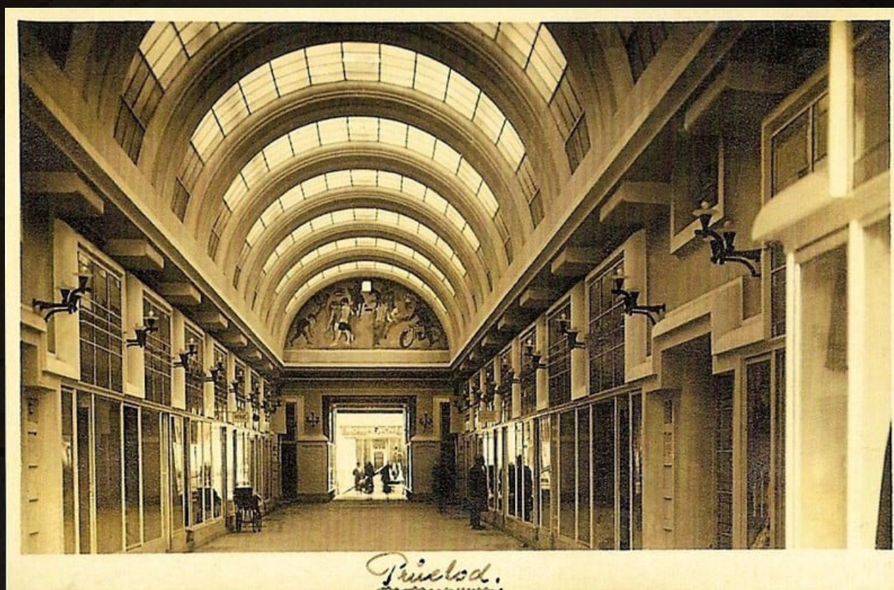
Machoň arcade